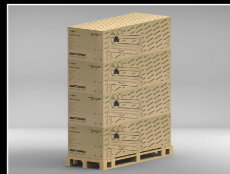
STORAGE Built to reduce at the minimum the encumbrance during the carriage and above all the storage space.