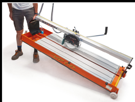
TRANSPORT WHEELS Easy to carriage