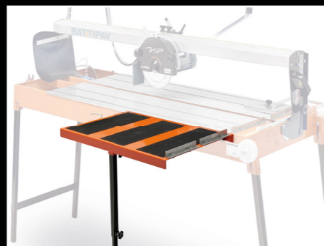
EXTENSION SIDE BENCH (art. 85015) It is very practical when need to cut large size of tiles. OPTIONAL